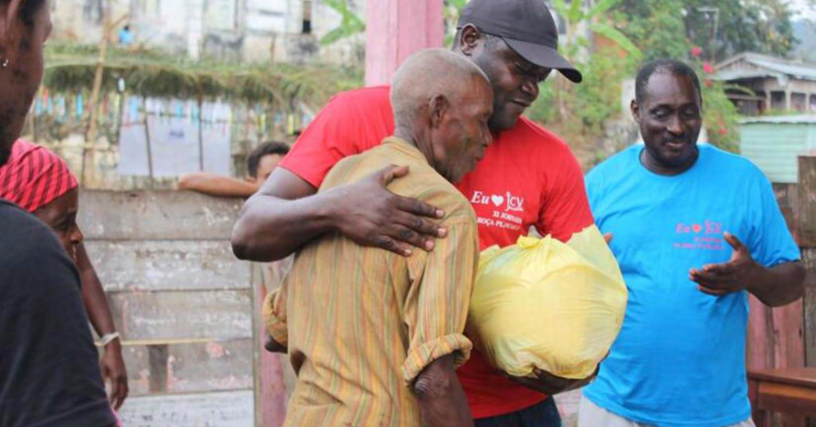
National Society volunteers carry out awareness campaign to fight against dengue fever at a school in Água Grande