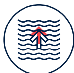
Sea level rise